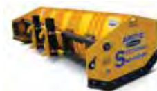
Arctic® Sectional Sno-Pusher™