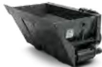
Side Discharge Bucket