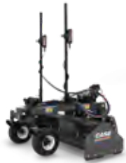
Laser Grading Box

All models come standard with a universal coupler that will work with numerous attachment manufacturers, meaning you can do more with a single machine to give your business even greater versatility. Consult your dealer for details.