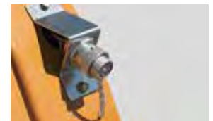
Front Electric/ Multi-Function