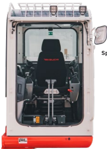
Spacious Operator Station