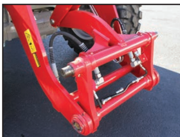
Hydraulic Quick Coupler