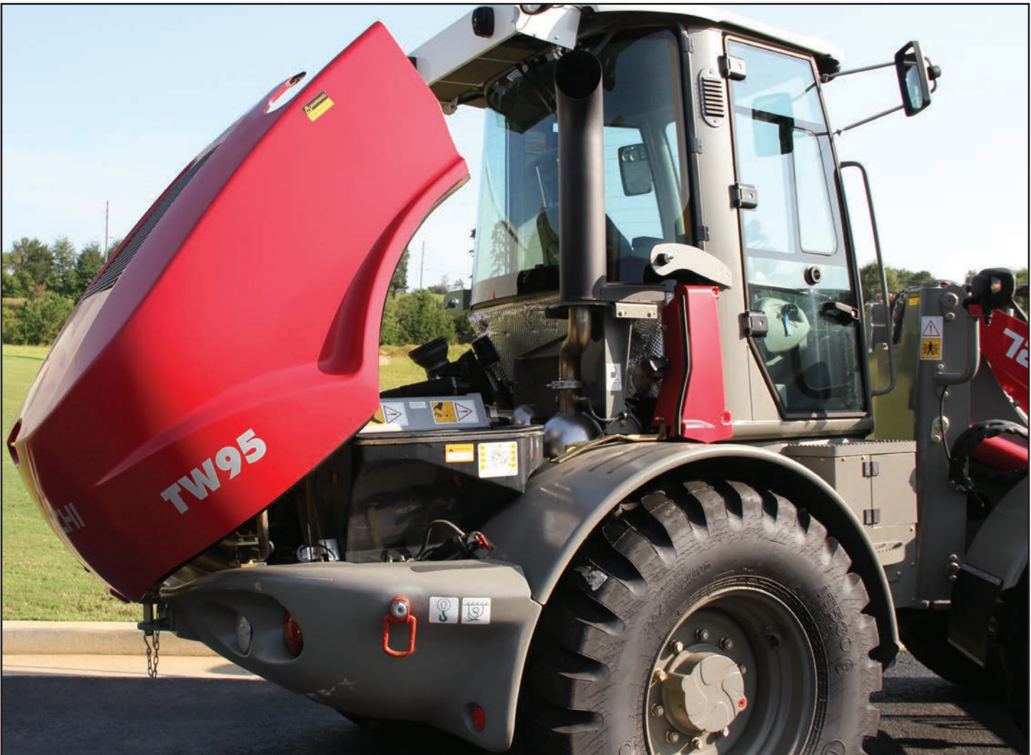
Large Lockable Rear Service Hood Provides Outstanding Service and Maintenance Access

functions. A standard hydraulic quick coupler makes changing attachments quick and efficient. The hydrostatic drive is responsive and delivers excellent power for loading applications, and it also provides dynamic braking, slowing the loader as the operator backs off the throttle. 100% locking differentials can be engaged at low speeds to provide maximum tractive effort in the most demanding conditions.