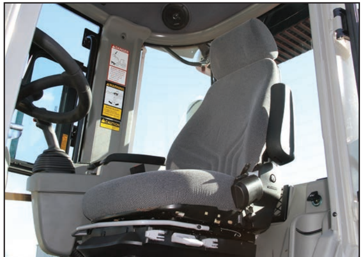
Deluxe Air Suspension Seat with Heat