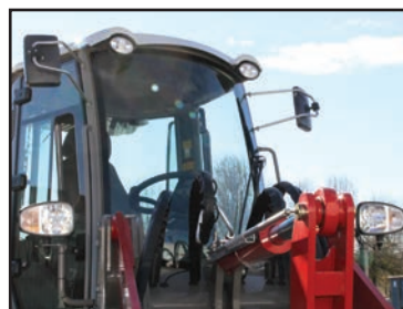
Road Lighting Package