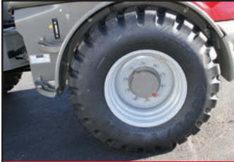
Heavy Duty Radial Tires