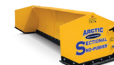
Arctic® Sectional Sno-Pusher™