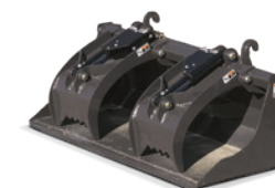
Scrap Grapple Bucket