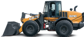
Large Wheel Loaders