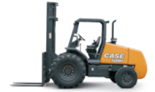
Rough Terrain Forklifts