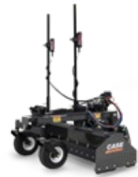
Laser Grading Box