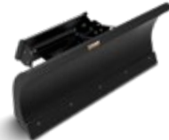
6-Way Dozer Blade