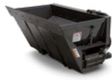
Side Discharge Bucket