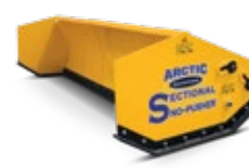
Arctic® Sectional Sno-Pusher™