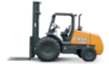
Rough Terrain Forklifts