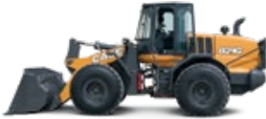
Large Wheel Loaders