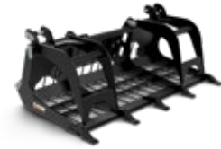
Grapple Rod Bucket