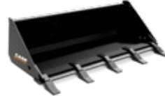
Low Profile Bucket