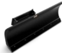
Light Material Blade