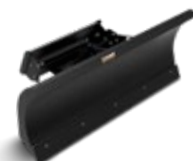
6-Way Dozer Blade