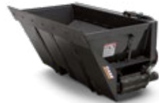
Side Discharge Bucket